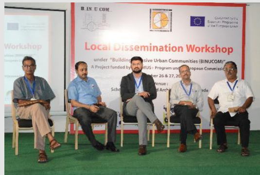
Panelists interacting with the audience