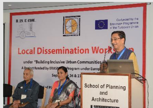
Guest of Honour, delivering his speech during the Inaugural Session