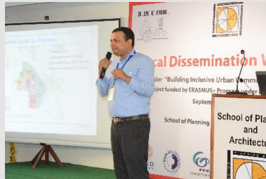
Regional Development Authority speaking on Day 2

Architect, presented on various topics pertaining to inclusivity, response to existing landscape, sustainable design principles (Optimizing suns energy, improving air quality, rain water harvesting, responsible use of land resource and other resources).