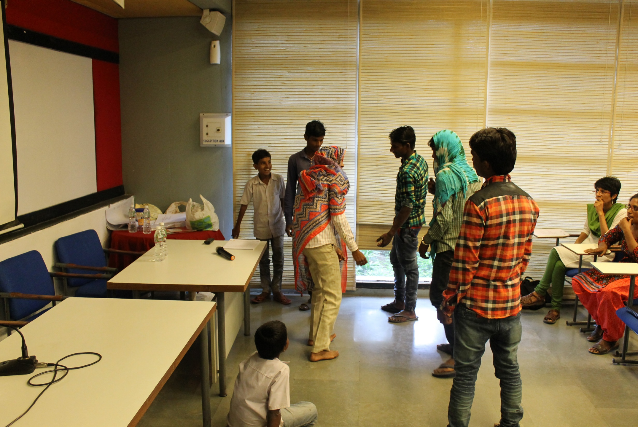
Migrant construction workers and their children present a 10-minute play on issues they face in the city