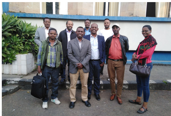
Attendees of the Stakeholders Workshop

The EiABC, SES team conducted a full day stakeholders workshop at Ghion hotel, Addis Ababa on the 31 st of October, 2019. The invited stakeholders comprised of experts, policy makers, local administrators, community leaders and actual residents of informal settlement areas from the selected case study sites.