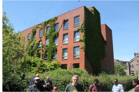
Visit conducted at GWL

Bijlmermeer (built between 1966 and 1975) is characterized by the renovation efforts after the failure of its modernist approach, which included strict segregation of residential, traffic, recreational and commercial functions.