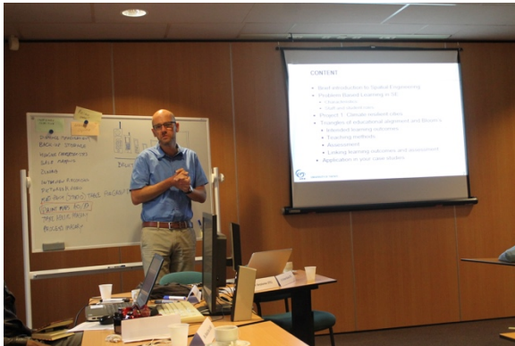
A series of micro lectures conducted by ITC staff

ITC also presented on project based learning approaches as they could be used in teaching and learning with case studies.