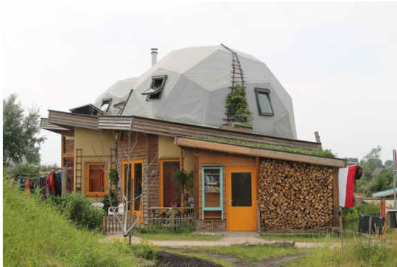
Visit conducted at Olst

The project was finalized in 2015 and includes 23 houses and a Community Building and is the first ecovillage project in the Netherlands.