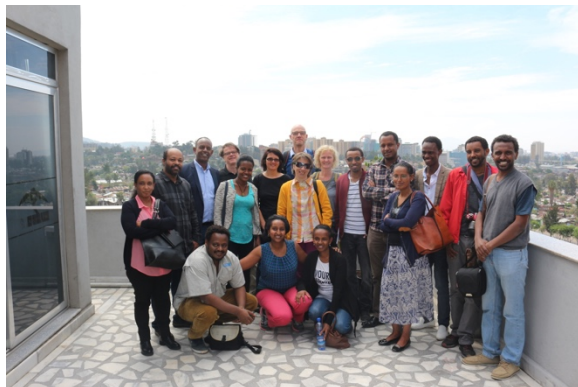
Commencement of thematic training at Tirar Hotel

Thematic Training and Site visit was conducted to SES project partners from DUK, Kassel, Twente (ITC), Mekele and Gondar Universities at Addis Ababa from 01-05 of May, 2017. Partners from Addis Ababa University, Ethiopian Institute of Architecture, Building Construction and City Development (EiABC) hosted the event. The five-day event comprised of site visits and training sessions.