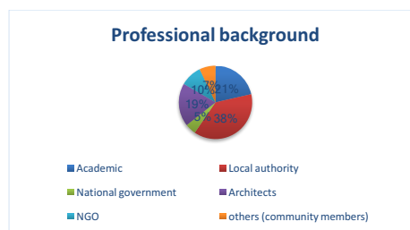
Figure - 1

In September 2017 the first national consultative conference on "Our Cities, Our Future: Towards Inclusive Neighbourhood" was conducted in Gondar by the consortium project "Social Inclusion and Energy Management for Urban Informal Settlements (SES)". The event engaged a range of stakeholders as such as academics, local authorities, representatives from the national government and NGOs and architects (see Figure 1).